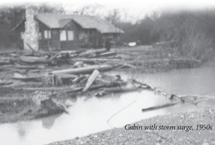
Cabin with storm surge, 1950s

The shoreline is ever changing, as the geologic history of the Elwha River Valley illustrates. The river has moved and the shape of the peninsula has changed. The Lower Elwha Klallam Tribe have lived along the river's changing form for thousands of years. In the 1950s, the shoreline was armored with rip rap and concrete in an attempt to combat erosion. But upstream dams on the Elwha River rendered these efforts a failure.