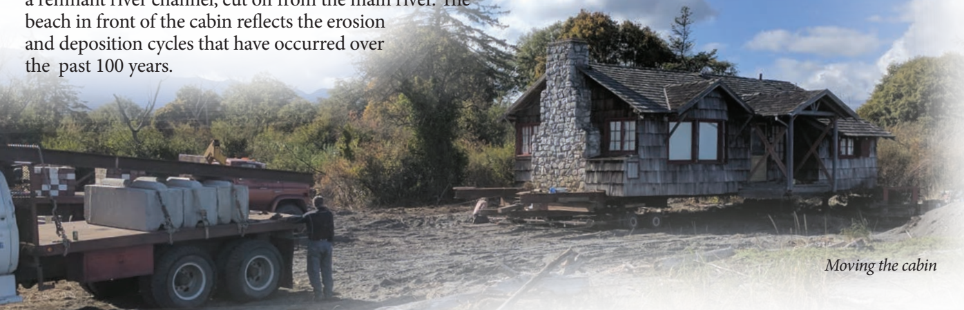
Moving the cabin

Go to www.coastawatershedinstitute.org for more information on Elwha nearshore ecosystem restoration.